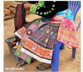
Pleated Skirt Design