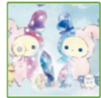
Rin (EIC 2019)

Message: Let' s exchange opinions about environment in GNI. See you again!